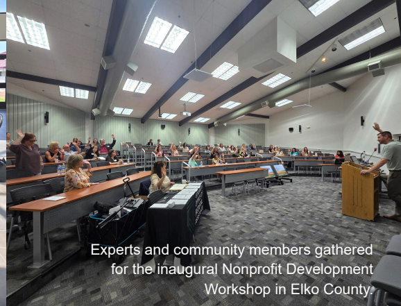
Experts and community members gathered for the inaugural Nonprofit Development Workshop in Elko County.